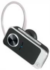
Motorola H695 Bluetooth Headset MBT695Z

Talk time: Up to 8 hours Standby time: Up to 200 hours