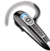
Plantronics 520 Bluetooth Headset PBT520Z

Talk Time: Up to 8 hours Standby Time: Up to 180 hours