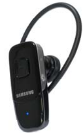
Samsung WEP707 Bluetooth Headset SBT707Z

Talk Time: Up to 6 hours Standby Time: Up to 200 hours