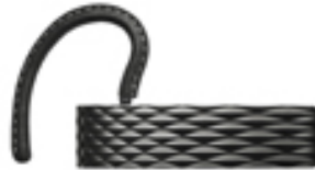
Jawbone w/Noise Shield Technology JAW2BTHS

Talk time: Up to 6 hours Standby time: Up to 350 hours